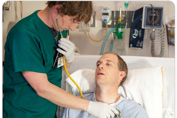
Respiratory therapists help people who are sick or recovering from surgery, or have a long-term lung disease such as asthma, bronchitis, emphysema, or cystic fibrosis.

You may also need respiratory care after a surgery or procedure, or during a lung test to assess your condition.